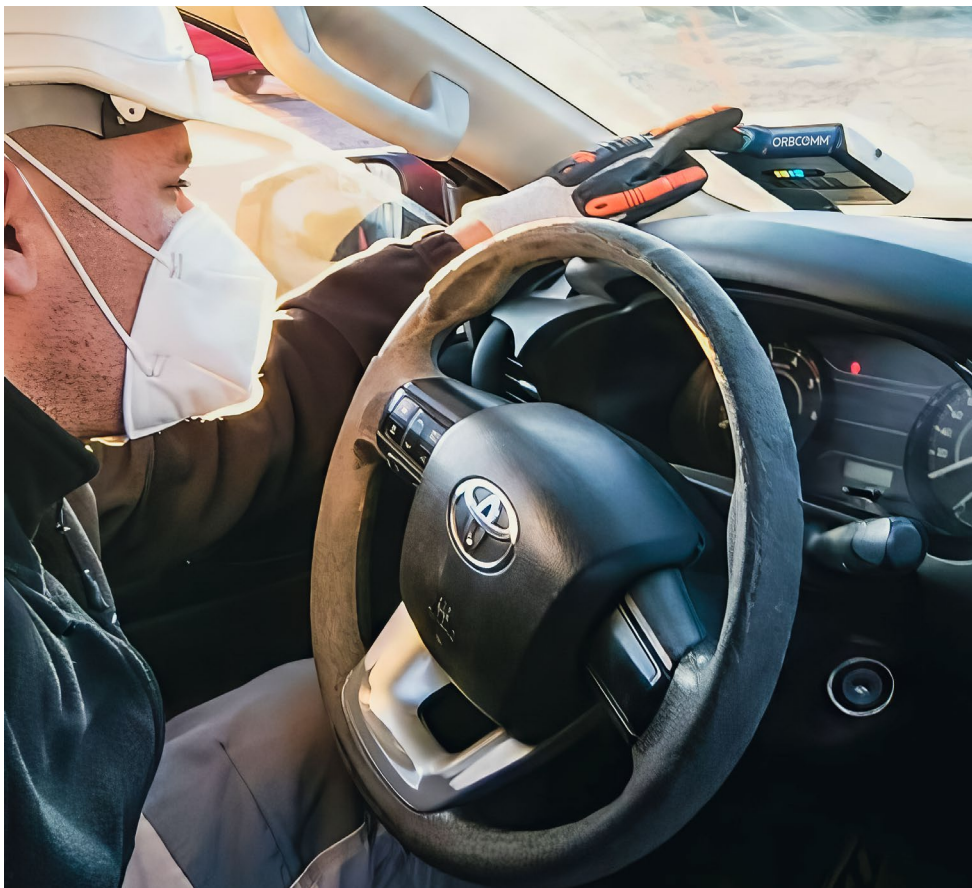
Driver interacting with ORBCOMM in-cab fleet safety device

To ensure quality performance, Do Better established a preventative maintenance program for the telematics devices which included a physical inspection every three months.